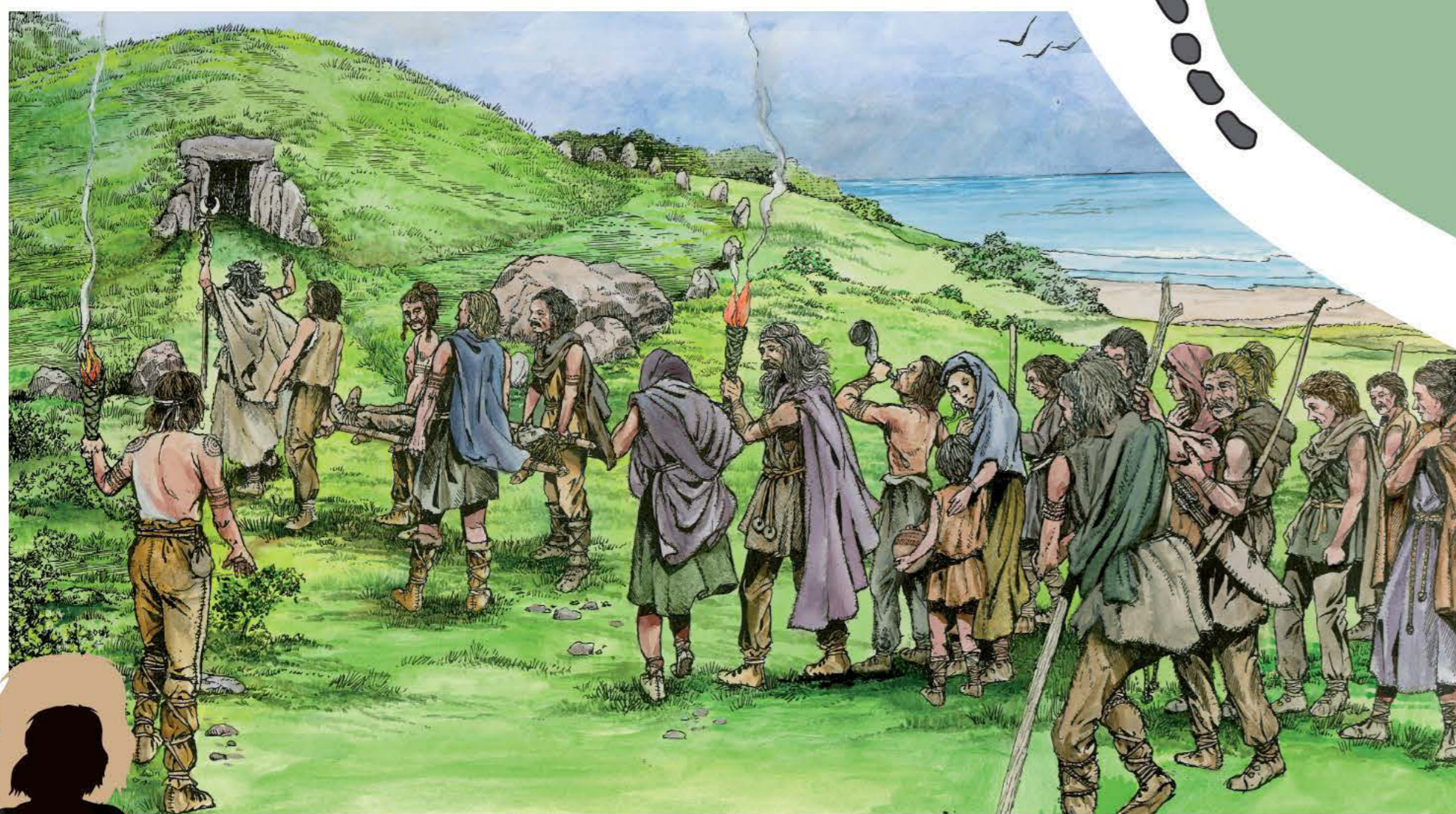
Artists impression of a burial party approaching the chamber Illustration by Brian Byron

The tomb is 10 metres long and the huge main capstone weighs well over ten tonnes. The uprights are graduated in size from the entrance to the rear. There is a small oval recess at the north-west corner of the chamber.