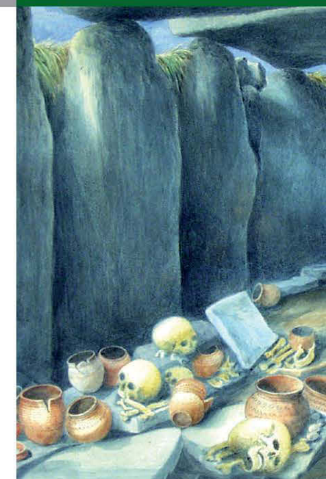
Detail from a painting by FC Lukis of the interior of La Varde showing excavated pottery and human remains

The site was discovered during military exercises in 1811 when human skulls and bones were unearthed. F C Lukis excavated the site in 1837. He recorded two layers of paving, indicating successive periods of use, and between and above these were quantities of burnt and unburnt human bone, indicating that successive burials or cremations were deposited within the chambers. Objects found in the grave included pottery, flint and stone tools. Complete pots and fragments of some 150 vessels were found, dating from the Middle Neolithic around 3500 BC, to the Early Bronze Age around 2000 BC.