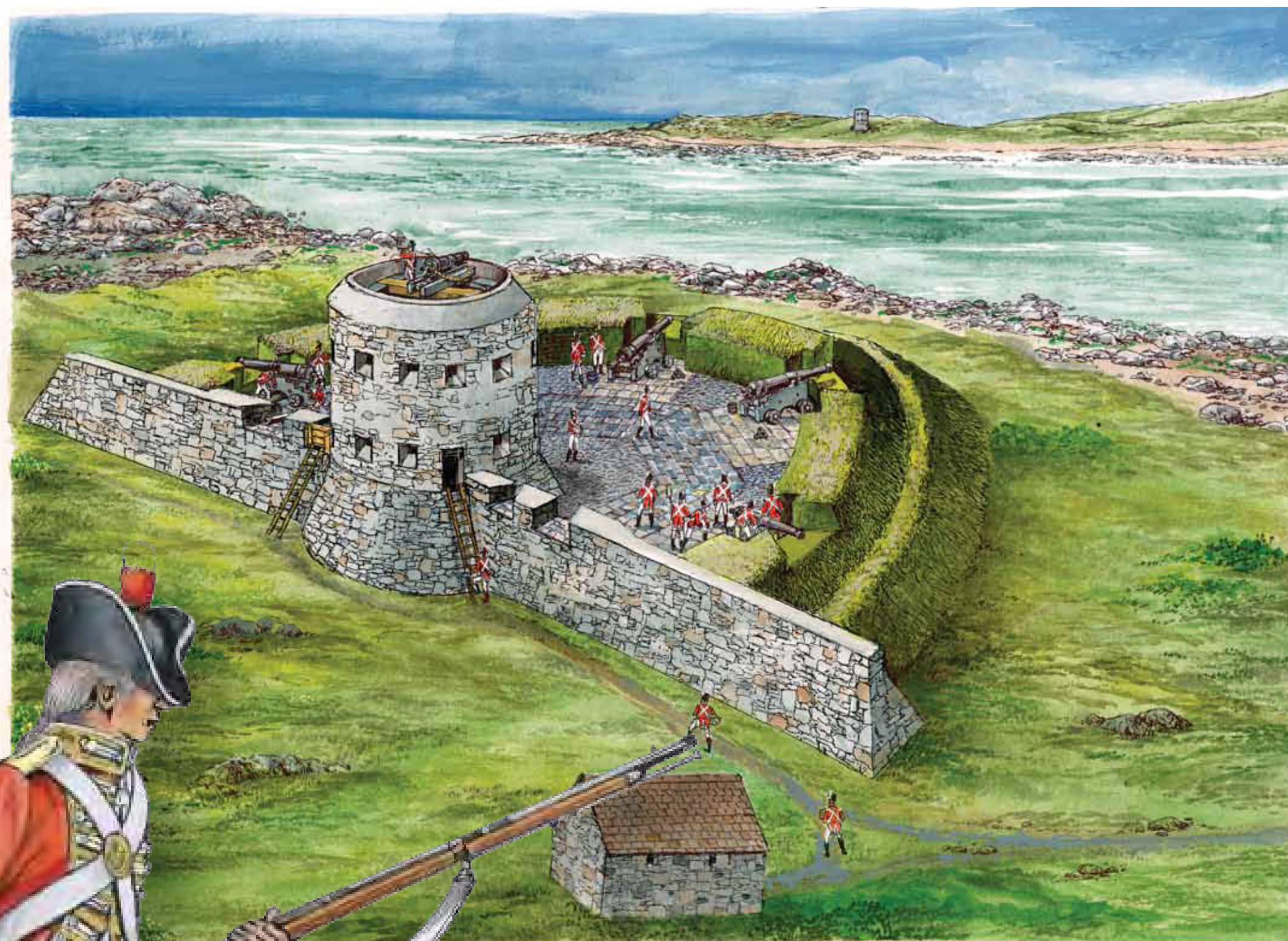
Illustration showing Rouse Tower and Battery c. 1816 (Brian Byron 2011)

The towers were an integral part of a more comprehensive line of defence which ran around the coastline of the Island. This included forts, cannon batteries and other defensive works. The towers were intended to function as guard houses and barracks and to support nearby cannon batteries.