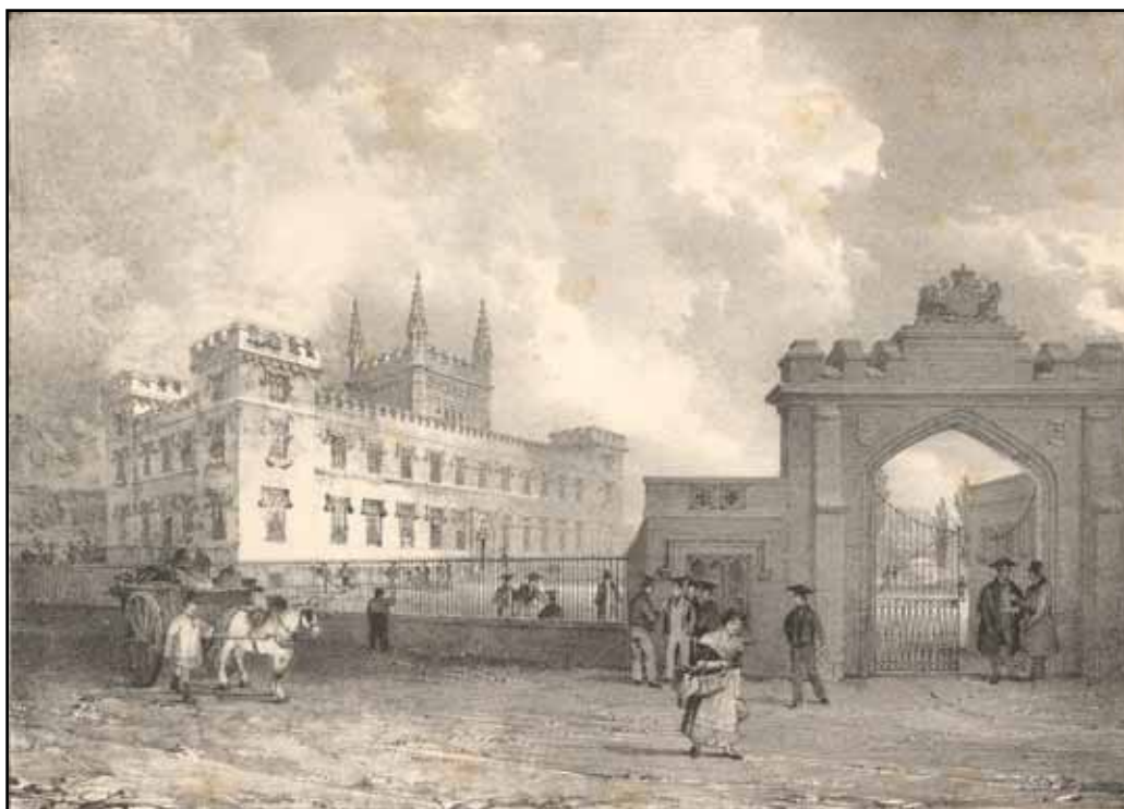
The School of Queen Elizabeth. 1830s.

This new School is the building that still stands to this day.